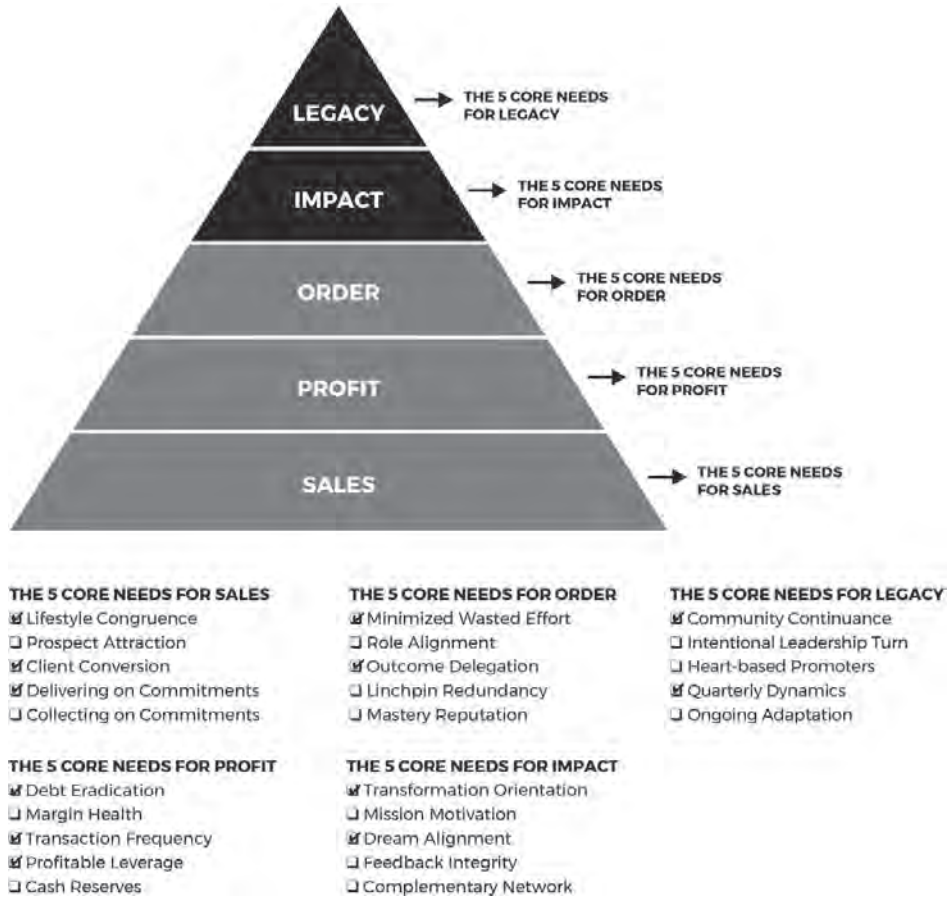
Figure 4. The BHN with satisfied Core Needs checked

level, Tersh left Prospect Attraction and Collecting on Commitments unchecked. At the PROFIT level, Margin Health, Profitable Leverage, and Cash Reserves were left unchecked. In ORDER, IMPACT, and LEGACY, other items remained unchecked.