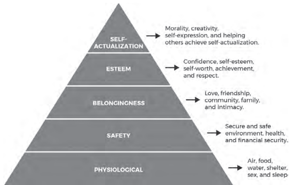
Figure 1. Maslow's Hierarchy of Needs

Even when we humans do have all of our basic needs met in our everyday lives, we sometimes find ourselves back at the bottom of